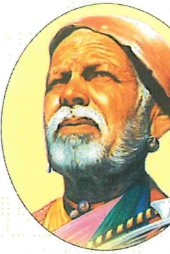
Sant Gadge Baba