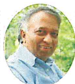
Padmabhushan Dr. Vijay Bhatkar