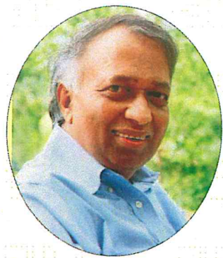
Padmabhushan Dr. Vijay Bhatkar